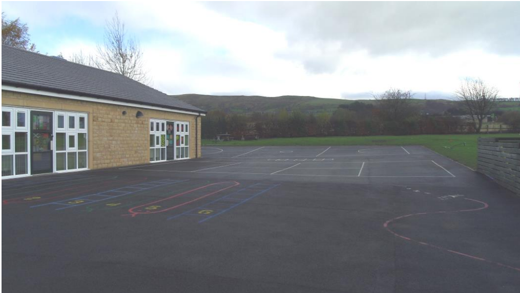
School Playing Fields to rear of School building

The school has recently carried out an audit of accessibility to the school by those with disabilities. The results of this audit have informed an accessibility plan, which covers future policies for increasing access by those with disabilities to the school. During the year we received outreach support from the SEND Service, Educational Psychology Service, Visual Impaired Unit, Speech and Language Therapy and Occupational Therapy. All these services have provided input, advice and oversight of Support Assistants in school.