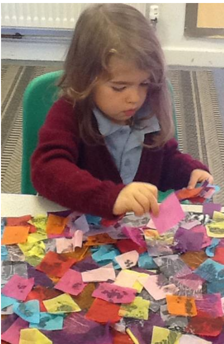
Learning how to mix colours through painting, cutting and sticking....

The Reception children have been counting objects and finding the number to match.