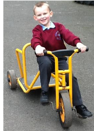
Practising riding the large bikes...