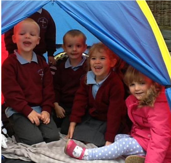
They have enjoyed playing in the tent together.