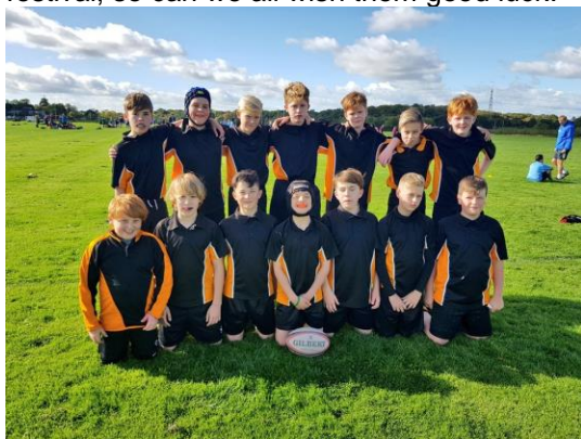
Tweedmouth Community Middle School

Once again our boys exceeded expectations and finished 2 nd in their pool beating Hayden Bridge 6 tries to nil, George Stephenson's 5 tries to 3 and losing to St Mary's by 1 try. Throughout the day, our boys conducted themselves fantastically well and many of them impressed scouts from the Newcastle Falcons. The boys will travel back down to Kingston Park in November to take part in a similar festival; so can we all wish them good luck.