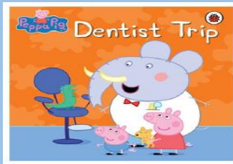
'Dentist Trip' by Ladybird Books