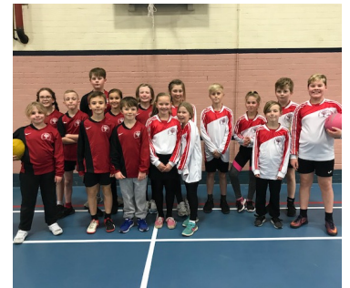
The winning team! Dodge, dip, duck, dive and dodge!

A big thank you to the Friends of Ibstock Junior