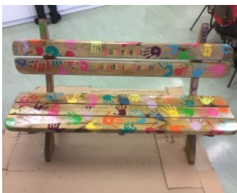
Our new Friendship Bench decorated by the children during Anti Bul-

can discuss during our Staff Development Evenings.