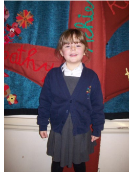
Support Staff Nomination Winner