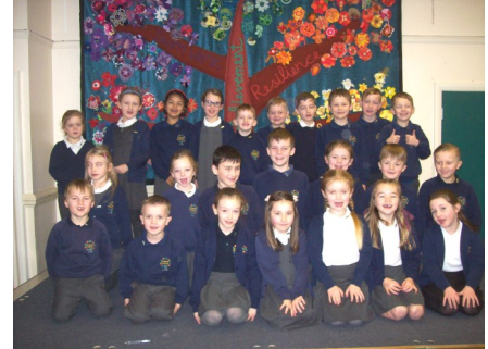
Stars of the Week