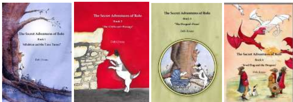
Book 1 - Athelstan and the Time Tunnel