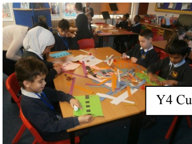
Y4 Curriculum Day