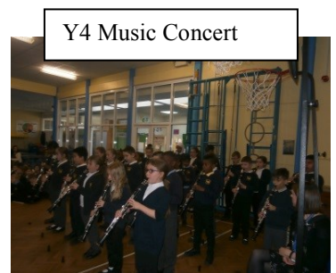
Y4 Music Concert