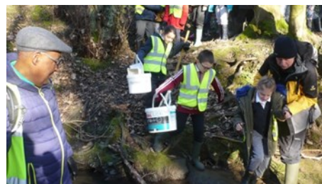
Y5 River Rea