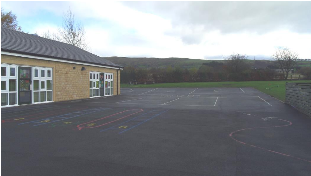
School Playing Fields to rear of School building

The school has recently carried out an audit of accessibility to the school by those with disabilities. The results of this audit have informed an accessibility plan, which covers future policies for increasing access by those with disabilities to the school. During the year we received outreach support from the SEND Service, Educational Psychology Service, Visual Impaired Unit, Speech and Language Therapy and Occupational Therapy. All these services have provided input, advice and oversight of Support Assistants in school.