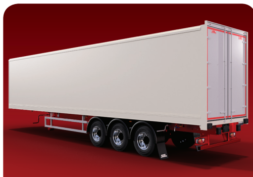
▲ SDC GRP ENXL Boxvan launched in 2018

"That is now one of the most popular products in the SDC portfolio," says Cushnahan. "Today we design and manufacture 4,000 curtainsiders annually."