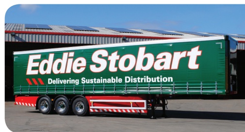
▲ Kinetic Energy Recovery System (KERS) semi-trailer that was unveiled at The CV Show in 2016

Regenerative braking systems have been adopted in automotive applications for many years, but the market has lacked a similar solution for articulated vehicles until now. SDC's engineering manager Jimmy Dorrian believes that the innovative KERS trailer is set to revolutionise the future of road freight transportation with