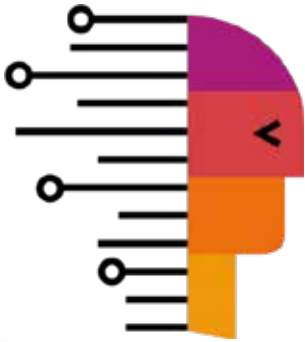
IT/Project Team / Consultants