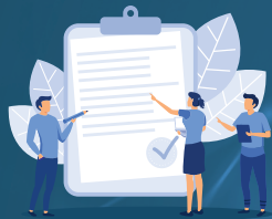
Career Centric Syllabus