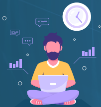
Skill Elevation: Practice Exercises