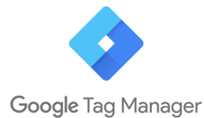
Google Tag Manager