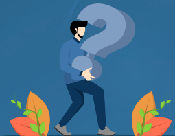
Doubt Clearing Session