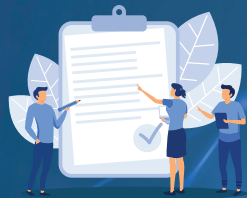
Career Centric Syllabus