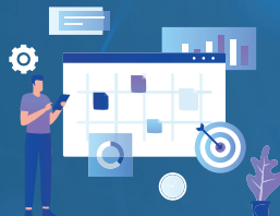
Industry Relevant Project