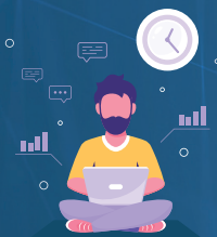
Skill Elevation: Practice Exercises