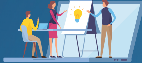
Industry Experts Led Live Sessions