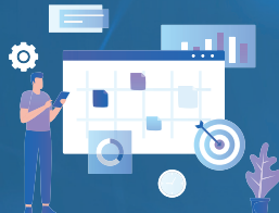
Industry Relevant Projects