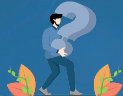
Live Doubt Clearing Session