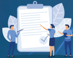
Career Centric Syllabus