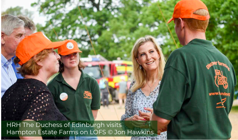
HRH The Duchess of Edinburgh visits Hampton Estate Farms on LOFS

Her Royal Highness The Duchess of Edinburgh, LEAF's Honorary President, supported LEAF Open Farm Sunday at Hampton Estate Farms' event in Surrey. During her visit The Duchess saw first-hand farming activities, learned about the history and process of hop growing, explored the role of technology and how regenerative farming promotes biodiversity. The Duchess also met some inspiring young people pursuing careers in the sector, including apprentices, a trainee vet, and the estate's butcher, as well as an aquatic biodiversity expert.