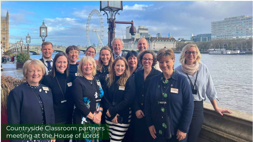
Countryside Classroom partners meeting at the House of Lords