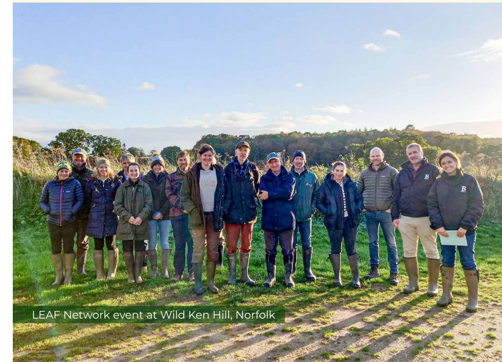
LEAF Network event at Wild Ken Hill, Norfolk