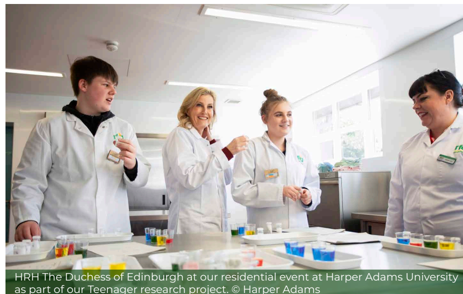
HRH The Duchess of Edinburgh at our residential event at Harper Adams University as part of our Teenager research project.

It was incredibly rewarding to work with so many young people and we thank everyone involved with the research. Read the full report at leaf.eco/education/research .