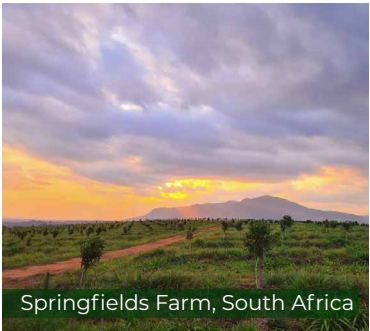
Springfields Farm, South Africa