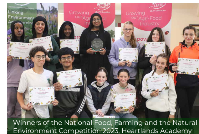
Winners of the National Food, Farming and the Natural Environment Competition 2023, Heartlands Academy