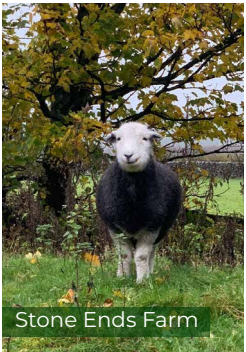
Stone Ends Farm

Our farmers will be supported throughout their Resilient & Ready journey with one-to-one advice, mentoring, training, and resources. We look forward to seeing what they achieve in 2024!