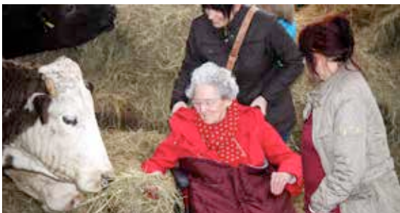
The social benefits of farming are addressed at the Let Nature Feed Your Senses conference