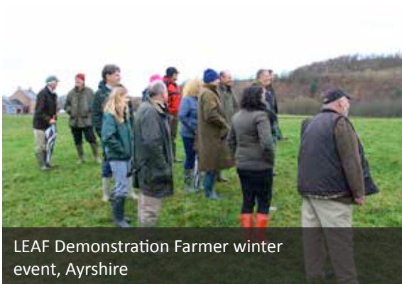
LEAF Demonstration Farmer winter event, Ayrshire