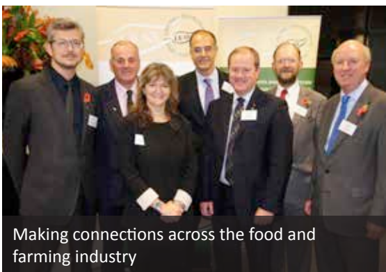
Making connections across the food and farming industry