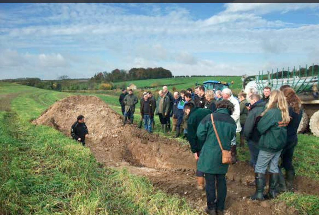
Providing opportunities for farmers to see IFM in practice