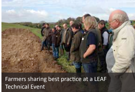
Farmers sharing best practice at a LEAF Technical Event