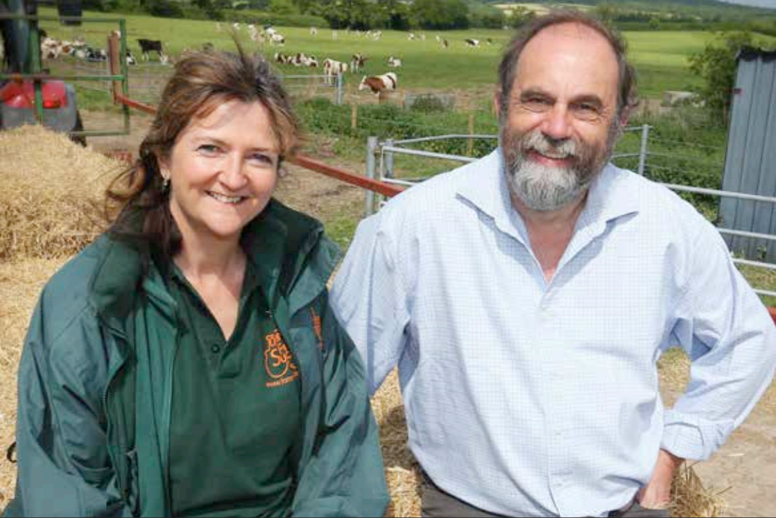
Open Farm Sunday – right at the heart of Government policy