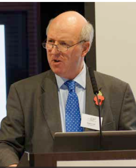
LEAF works to inspire and enable sustainable farming