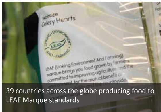
39 countries across the globe producing food to LEAF Marque standards