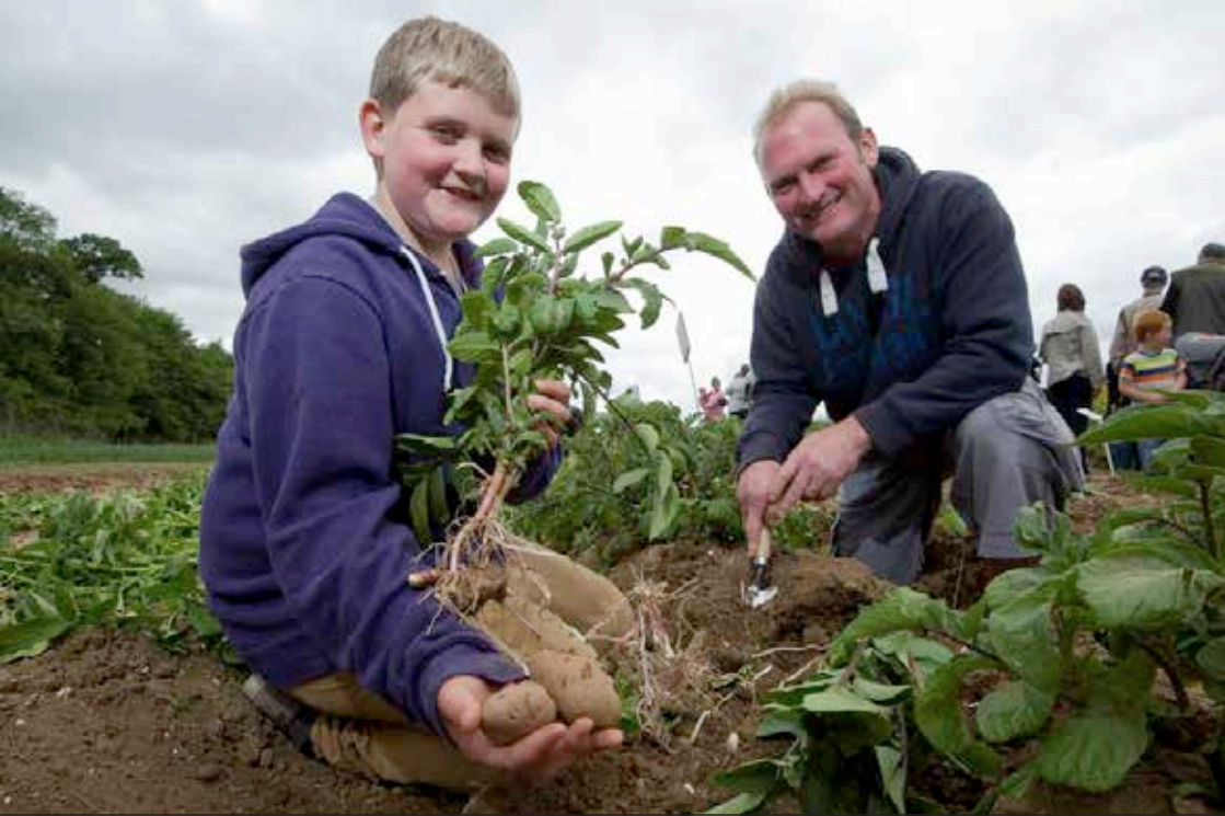
Proud to be working with the Food for Life initiative to improve children's whole experience of food