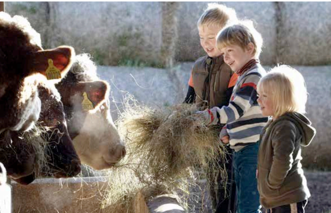
Open Farm Sunday 2013 sees a massive 200, 000 visitors and 365 farms opening their gates