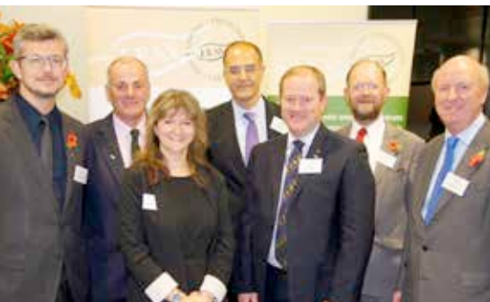
LEAF's President's Event explores the economics of sustainable farming