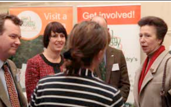
HRH Princess Anne visits LEAF at the Oxford Farming Conference