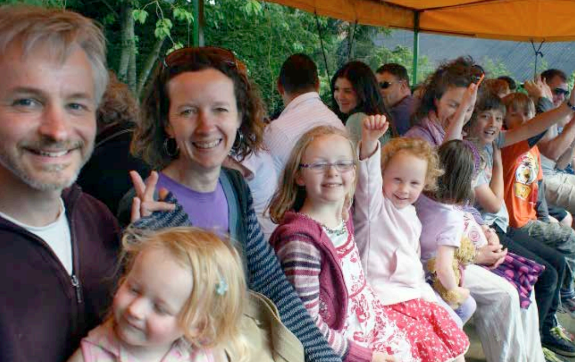
This year's Open Farm Sunday broke all the records!