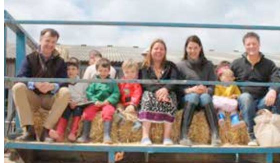
A record breaking Open Farm Sunday 2013