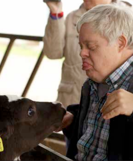
Over 14, 000 people learning about food, farming and nature, through the Let Nature Feed Your Senses project