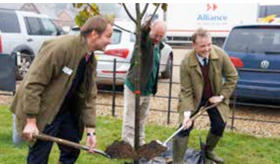
Elveden Farms joins the LEAF Demonstration Farm network