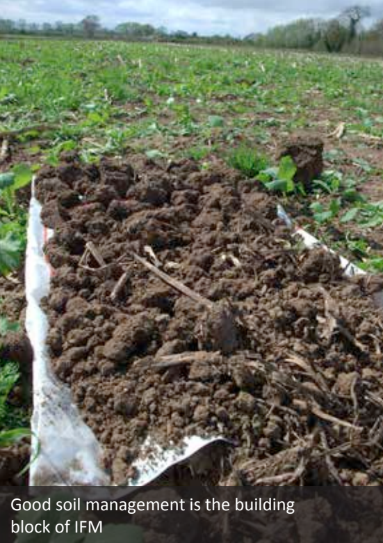
Good soil management is the building block of IFM