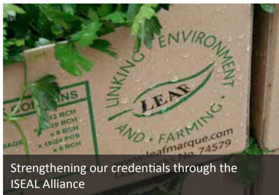
Strengthening our credentials through the ISEAL Alliance