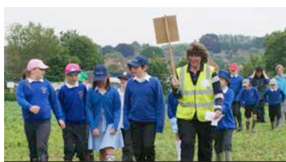
Open Farm School Days welcome 3,000 school children onto farms