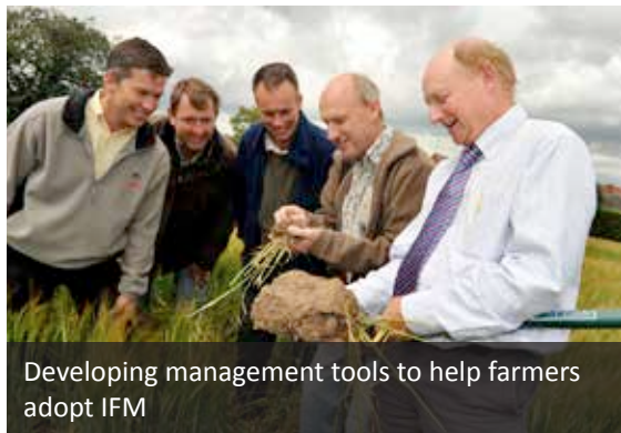
Developing management tools to help farmers adopt IFM