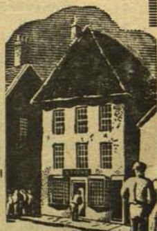
Toad Lane, Rochdale, 1844