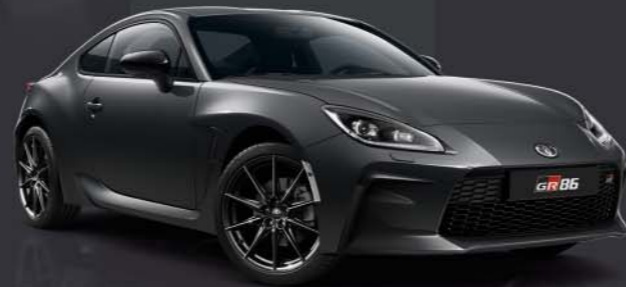
Magnetite Grey (P8Y)§