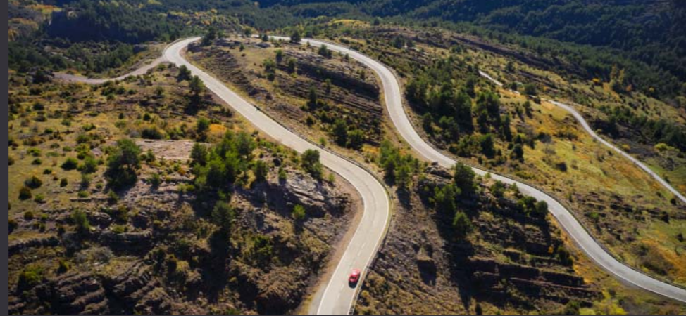
GR86's low centre of gravity makes handling corners effortless.

Our most enviable coupe, GR86 draws admirers for its outstanding performance. Precise steering and a rigid body deliver superb handling and control, while a low centre of gravity and excellent traction during cornering ensure it responds to your every direction.