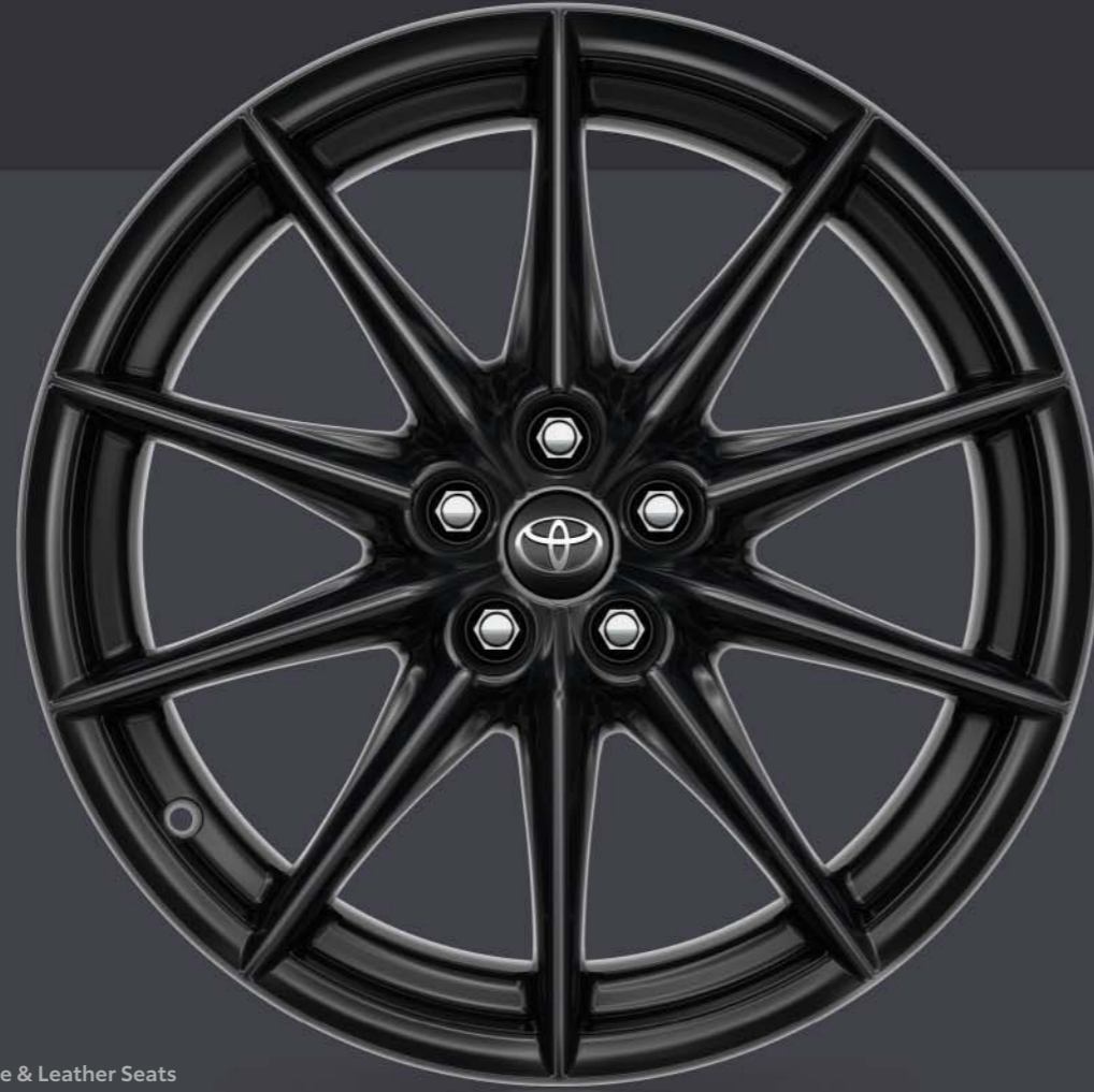
Ultrasuede & Leather Seats