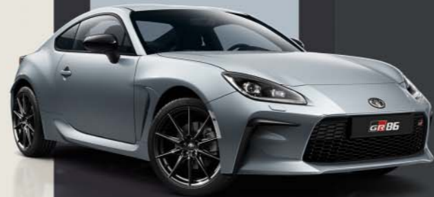
Ice Silver (G1U)§