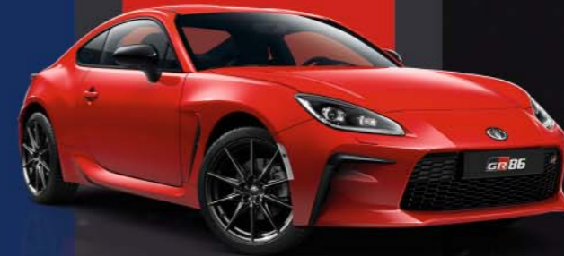
Ignition Red (DCK)*