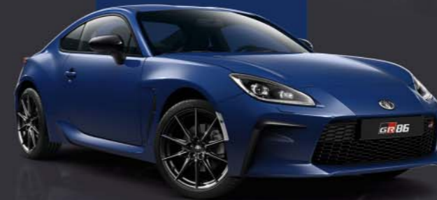
Sapphire Blue Pearl (WCH)*