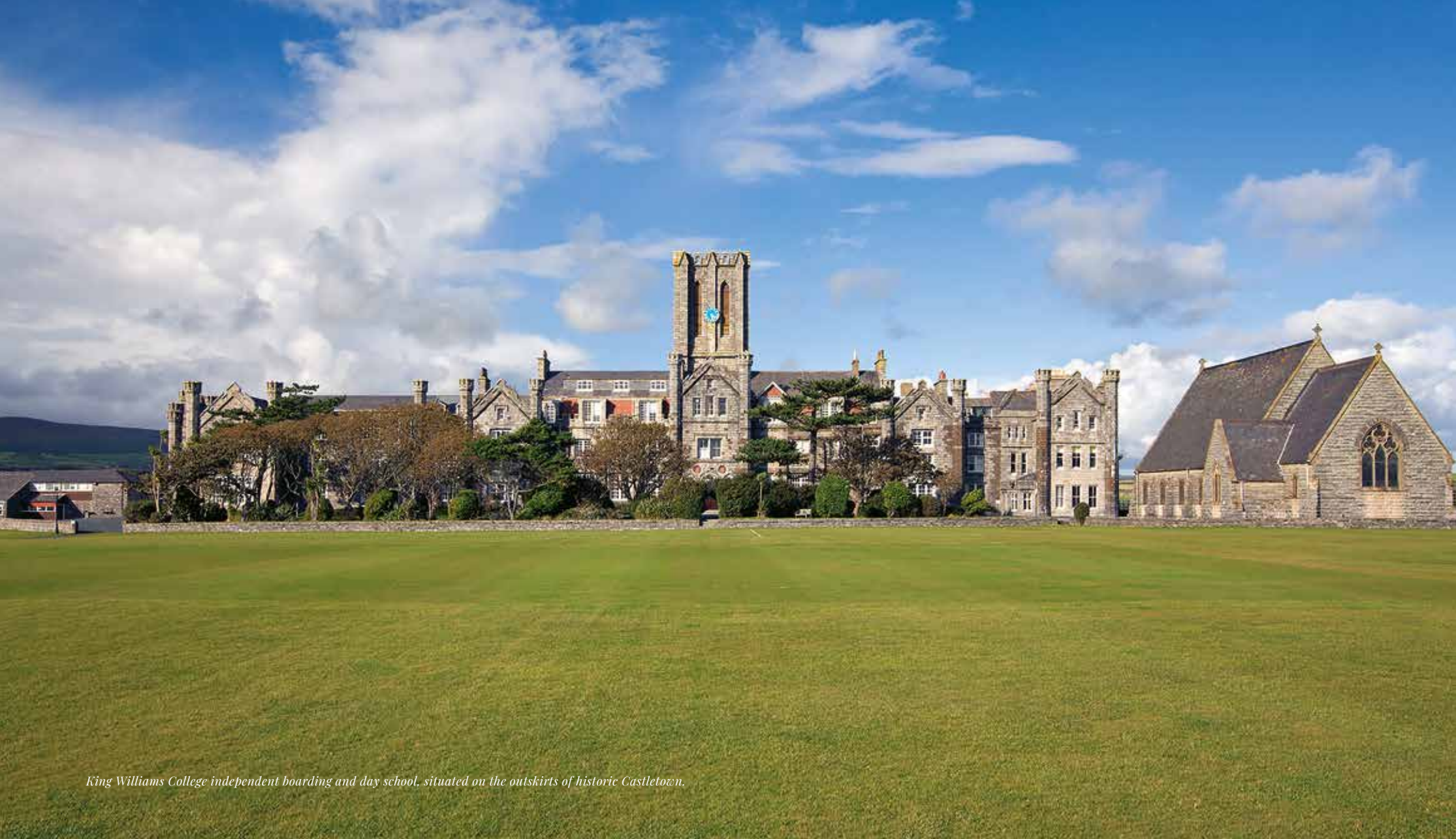
King Williams College independent boarding and day school, situated on the outskirts of historic Castletown.