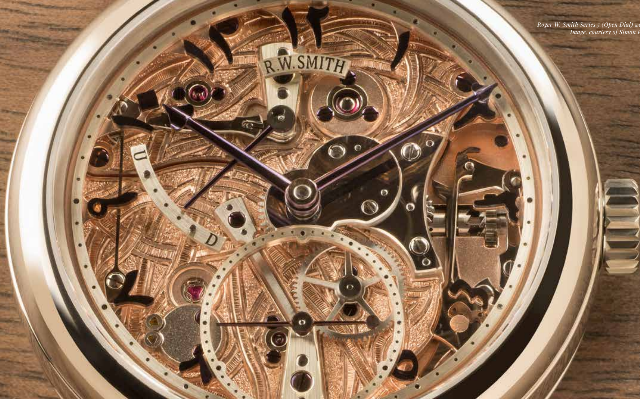
Roger W. Smith Series 5 (Open Dial) watch