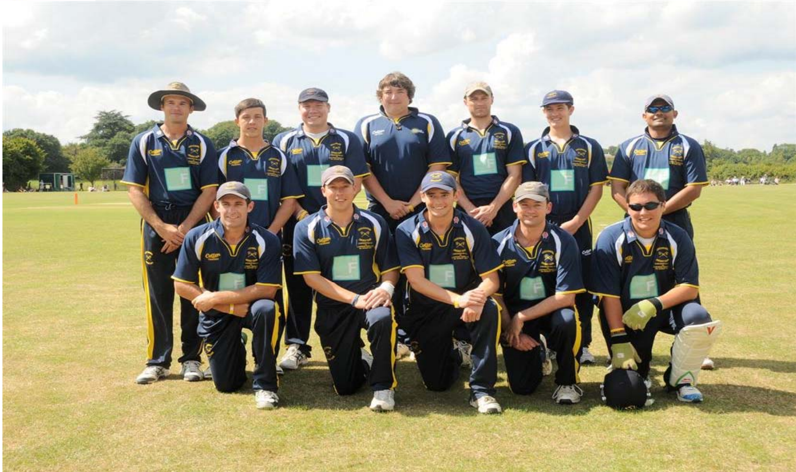
CHESSINGTON CRICKET CLUB