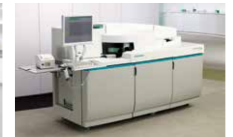
Dimension EXL Integrated Chemistry System