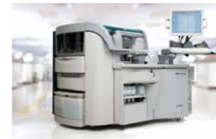
ADVIA Centaur XP Immunoassay System

Siemens Healthcare Diagnostics is driven to create forward-thinking answers that can change the way your laboratory operates for the better. A recognized leader in cardiovascular-disease testing, Siemens provides a comprehensive and expanding menu of cardiac biomarkers across a broad spectrum of instrument solutions that help manage patients throughout the continuum of cardiovascular disease.