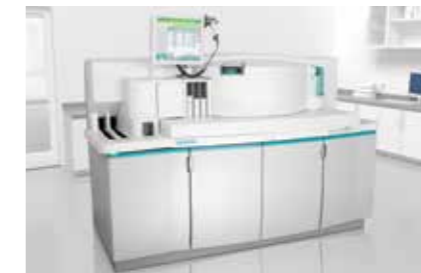
Dimension Vista 500 Intelligent Lab System