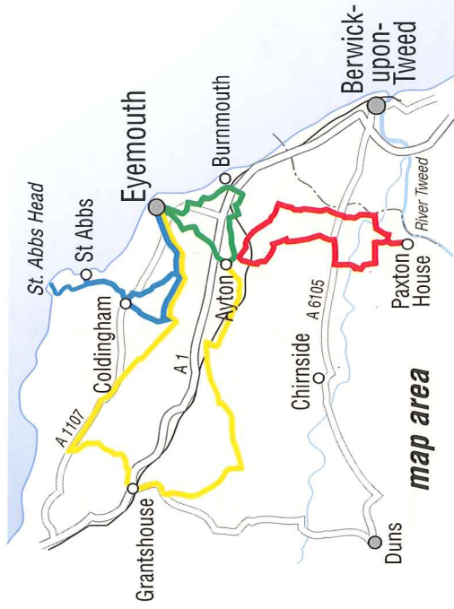
Designed by Scottish Borders Council Graphic Design Section. Printed in the Scottish Borders

Note:- The road between Coldingham and St. Abbs may become fairly busy (by Scottish Borders standards!) on fine weekends in summer, so plan accordingly, doing the trail early or late in the day at weekends or sometime during the week.