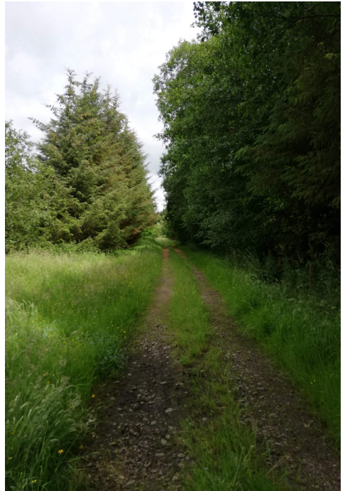
Across the Borders Railway Line

Border it did not actually enter Scotland until crossing the Kershope Burn here, some 34km from Carlisle. Having crossed the burn and passed through a gate, you are on a low embankment across a field. This field is the historic Tourney Holm where cross-border disputes were settled in the Reiving days.