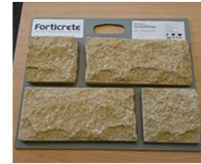
WALLS Forticrete Anstone Standard Buff Pitched Finish.