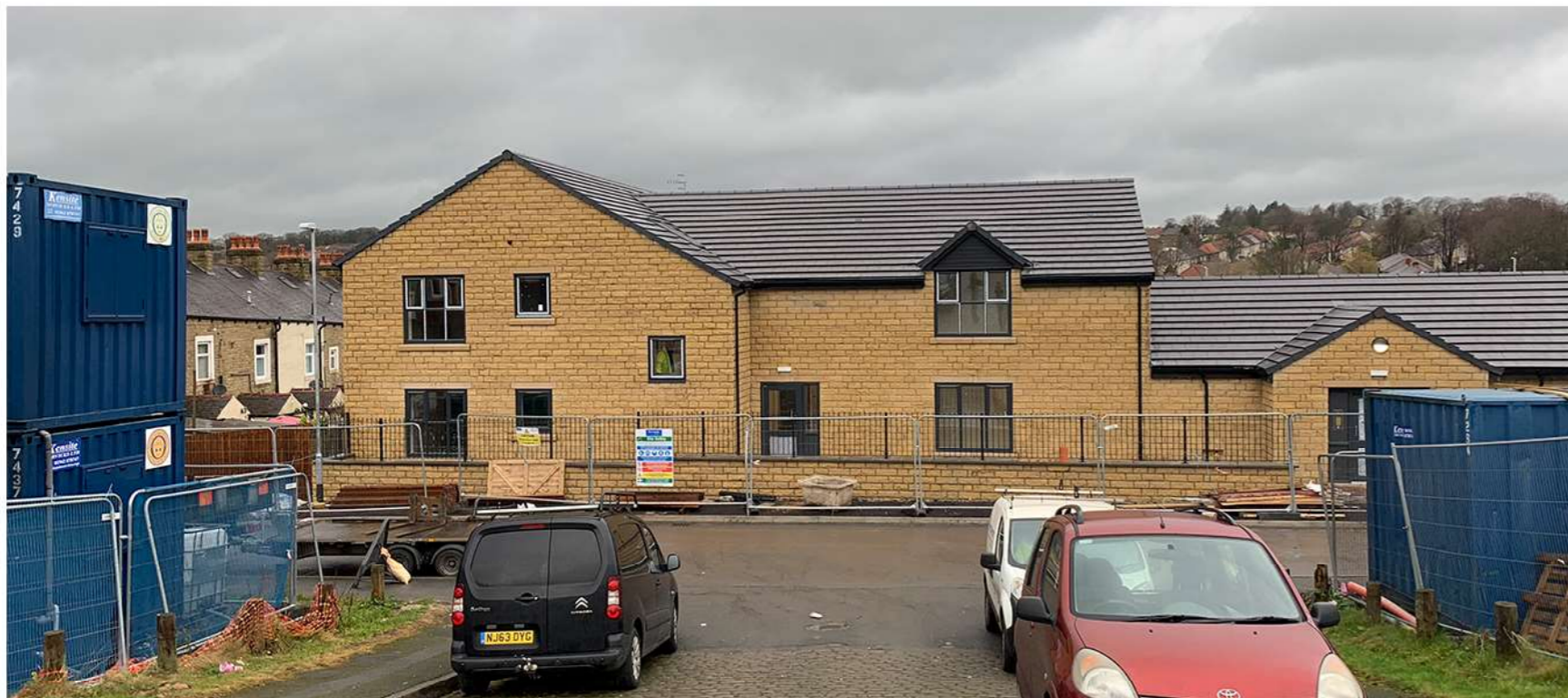
PRECEDENT: Argyle Street, Colne