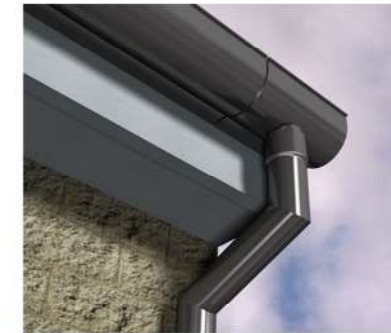
RWP + SVP Marley Eternit Black uPVC half-round Rainwater goods and SVP.