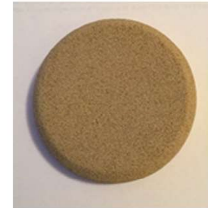
STONE FOR HEADS AND CILLS Monarch Artstone Colour: York Stone