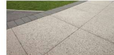
CHARCOAL CONCRETE FLAGS Marshalls Saxon 600 x 600mm concrete paving flags in 'Charcoal'.