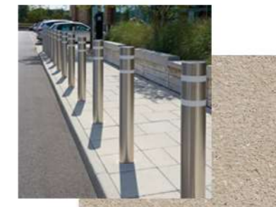
CONCRETE CURB Marshalls Saxon concrete curb in 'Natural'.