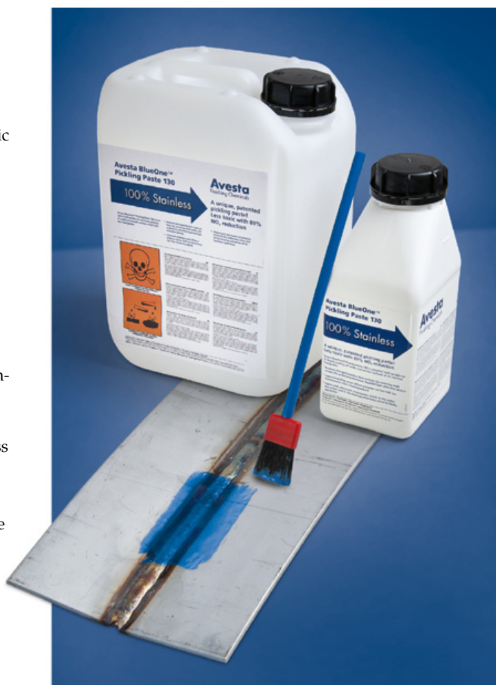
Avesta BlueOne™ Pickling Paste 130 is unique and covered by a world patent.