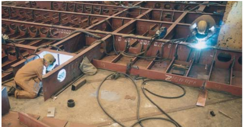
OK Tubrod 14.12 can be universally applied at one parameter setting.

A major application area for OK Tubrod 14.12 is shipbuilding, especially production in thinner plate material, such as ferries, cruisers, coasters, river boats, fishing boats, light displacement service vessels and yachts. Outside shipbuilding, applications are found in general steel construction, the welding of pipes and the fabrication of vessels.