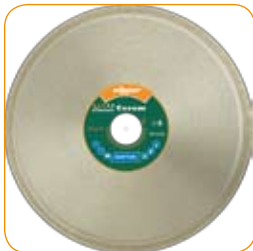
CLASSIC CERAM Ø 180 x 25,4mm