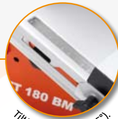
Tilting table (0° to 45°).