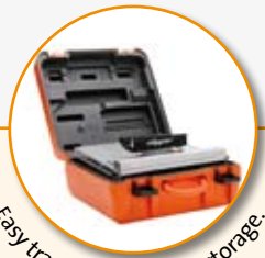
Easy transportation and storage.