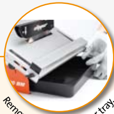
Removable plastic water tray.