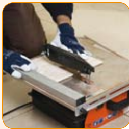
Light and compact