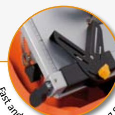
Fast and precise locking cutting guide.