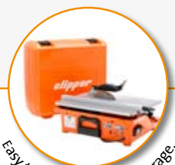
Easy transportation and storage.