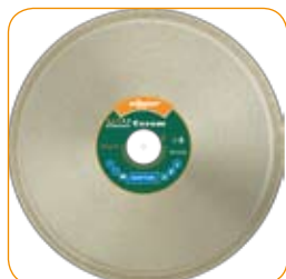
CLASSIC CERAM Ø 200 x 25,4mm