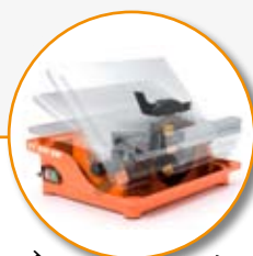
Tilting head (0° to 45°).