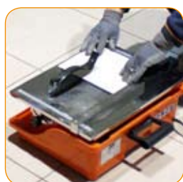
Precise cutting guide.