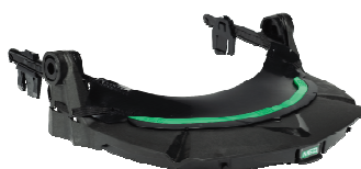
10115730 – V-Gard Standard frame for slotted helmets with debris control