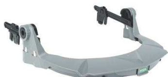
10121267 - V-Gard Standard frame ET (Elevated Temperature)