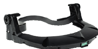
10121268 – V-Gard Universal frame