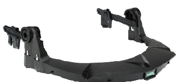
10121266 – V-Gard Standard frame for slotted helmets