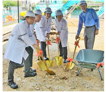
Working on the new Fragrance Encapsulation Centre