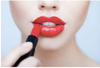
Lipstick sale going strong