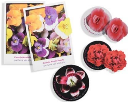
The new promotional object is made from a fragrance card