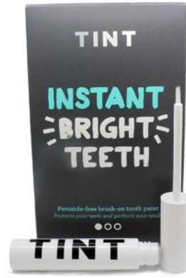
A brush for evenly spreading the formula