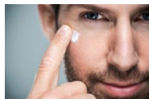
Reaching men via samples