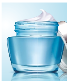
Proven efficacy against blue light exposure