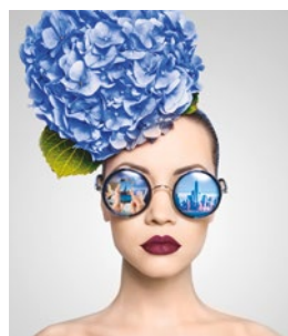
UV filter with broadest protection currently available