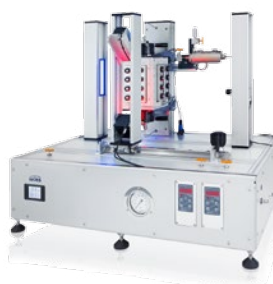
High Pressure Foam Analyzer – HPFA for foam analyses under oil reservoir conditions

With its High-Pressure Foam Analyzer – HPFA KRÜSS GmbH is launching the world's first measuring instrument for the simultaneous capture of foam height and foam structure under high pressure. The HPFA is intended primarily for the tertiary oil production sector, where foams boost the efficiency of flooding procedures using gases such as carbon dioxide or nitrogen. The foam improves flow control, so that the oil can be extracted efficiently from the rock. The foams used must remain stable for a