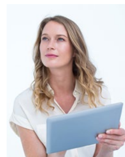
Decreases ROS during blue light stress