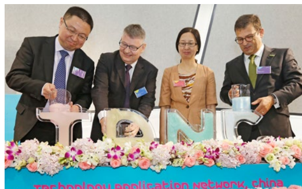
Merck's first application laboratory in China