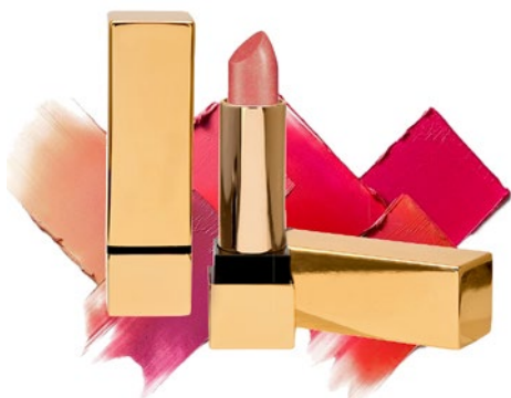
Smooth torque for a luxurious feel

TOLY | The Quadro Lipstick pack is a sleek square lipstick. Its elegant look and luxurious feel are due to its smooth torque. Composed of ABS, the exterior can be decorated using high quality finishes.