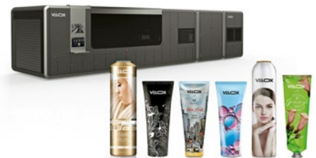
Digitally decorated containers

VELOX | IDS 250 is the first industrial-grade digital decorator for mass production of cylindrical containers. It delivers better decoration quality than analogue printing solutions, a more efficient production process and a low cost of ownership.