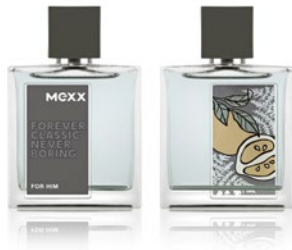
Labels as an integral style element of the brand message