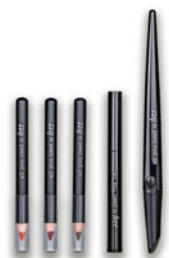
With less than 10 ingredients