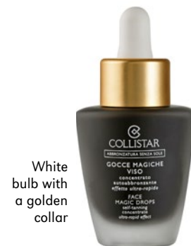
White bulb with a golden collar