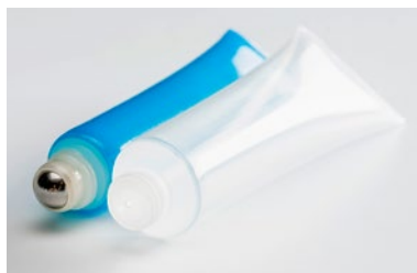
The metal roller ball provides a cooling touch

QUADPACK | The new PCR Tube available in two sizes is made entirely of recycled plastics. The smaller tube is ideal for samples or gifts with purchase. It features a metal roller ball to glide the formula onto the skin. For more aggressive bulks the PCR Tube can be endowed with an inner layer of EVOH to protect the formula from oxidation and prevent product migration. Anti-UV