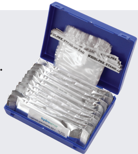
Legionella Field Test™ product code 100104

The test kit contains everything required to perform 10 tests — including sample collection containers and disposable pipettes.