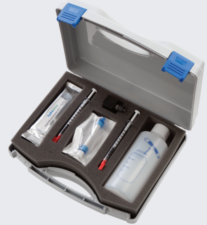
System Legionella Field Test™ Kit product code 100182

The test kit contains all the items required to perform 5 tests and includes a fitting for connection to water systems.