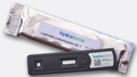
Legionella Single Test™ Swab Kit product code 100220