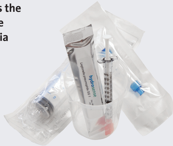
Single (Syringe) Legionella Field Test™ product code 100198