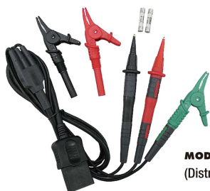
MODEL 7121B (Distribution board test leads)