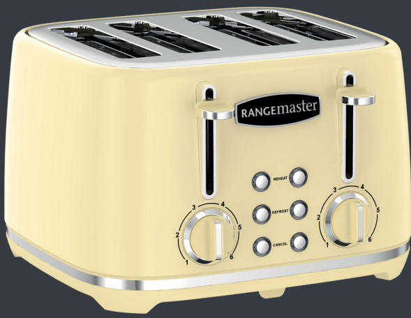
4 SLICE TOASTER