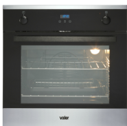
Valor VBI60FP Stainless Steel