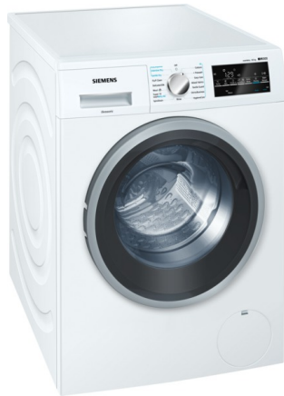
iQ500 WD15G421GB Automatic washer dryer