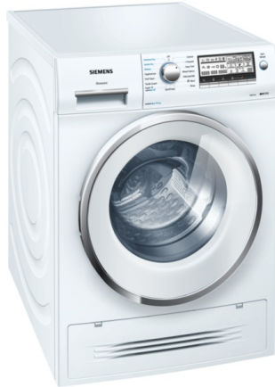
iQ700 WD15H520GB Automatic washer dryer