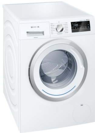
iQ300 WM14N200GB Front loading automatic washing machine