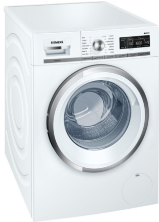
iQ500 WM16W590GB Front loading automatic washing machine