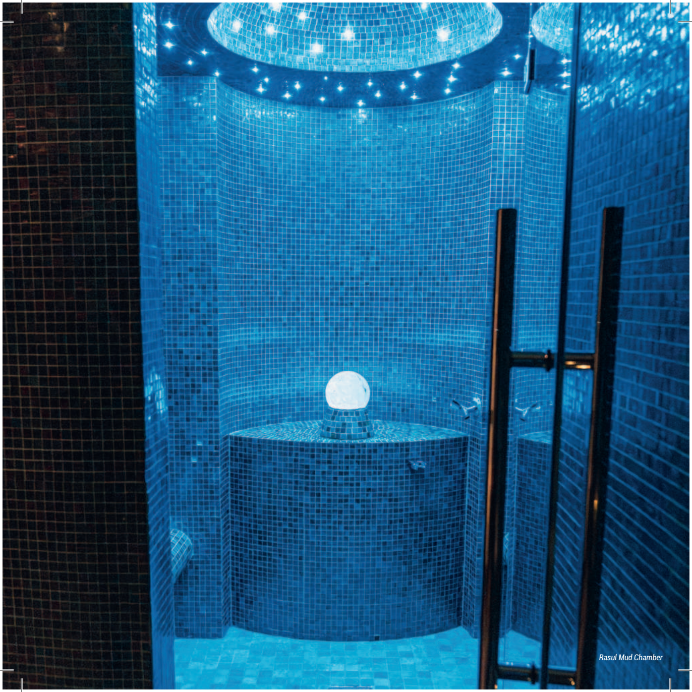
Rasul Mud Chamber