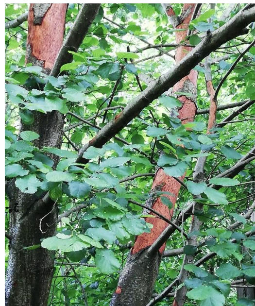
Fig. 1. Bark stripping by grey squirrels.

Shooting and trapping can be expensive. For instance, in 2015, 21,000 grey squirrels were culled in the North of England to protect red squirrel populations and tree health. Costs are variable, but the work by Red Squirrels Northern England cost an estimated £60 per squirrel. Culling alone has so far failed to bring the problem under control because the reproductive rate of grey squirrels far exceeds the numbers culled. Oral contraceptives represent an alternative and complementary means of grey squirrel management when used either as a standalone method or in addition to culling.