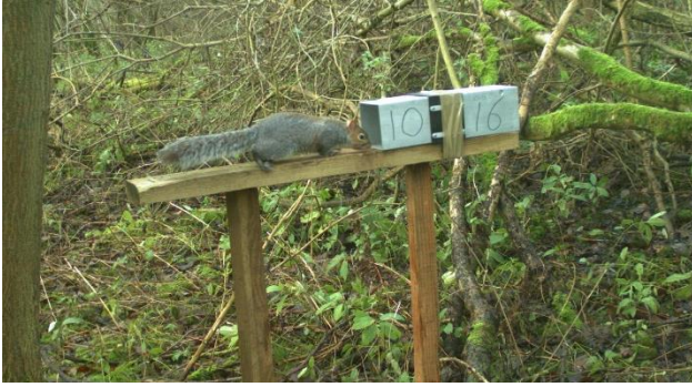
Fig. 2 Hopper used to deliver baits to grey squirrels.