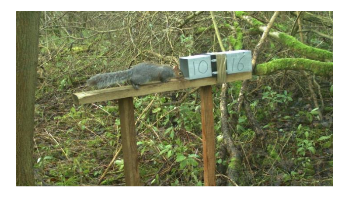
Fig. 2 Hopper used to deliver baits to grey squirrels.

The contraceptive will be added to a food bait that is delivered in a grey squirrel-specific feeding hopper (see Q21). The palatability of bait to grey squirrels is being tested in captivity and field trials.