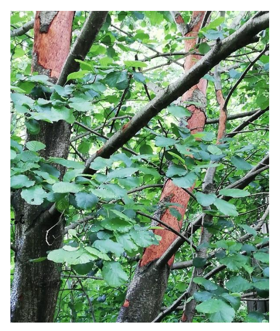
Fig. 1. Bark stripping by grey squirrels.

Shooting and trapping can be expensive. For instance, in 2015, 21,000 grey squirrels were culled in the North of England to protect red squirrel populations and tree health. Costs are variable, but the work by Red Squirrels Northern England cost an estimated £60 per squirrel. Culling alone has so far failed to bring the problem under control because the reproductive rate of grey squirrels far exceeds the numbers culled. Oral contraceptives represent an alternative and complementary means of grey squirrel management when used either as a standalone method or in addition to culling.