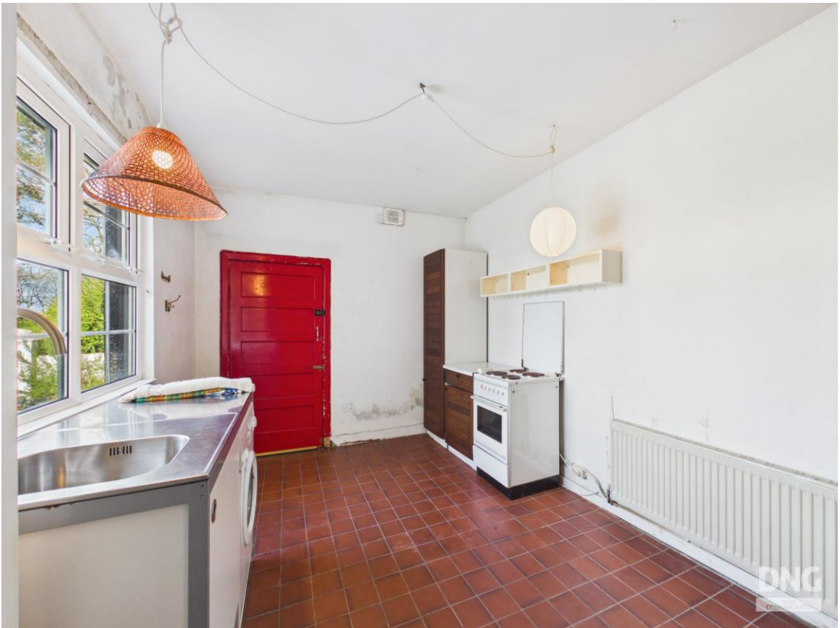
Residence On C. 37 Acres, Barroe Upper, Riverstown, F52 F207