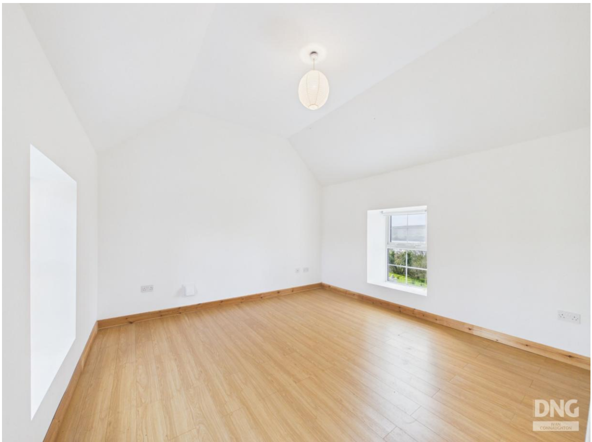
Residence On C. 37 Acres, Barroe Upper, Riverstown, F52 F207