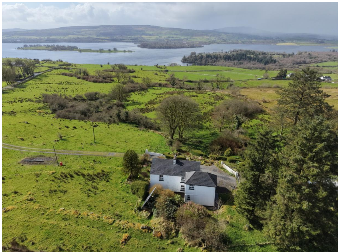
Residence On C. 37 Acres, Barroe Upper, Riverstown, F52 F207