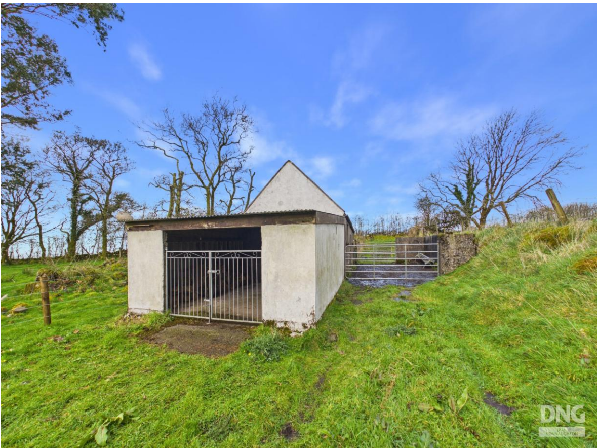
Residence On C. 37 Acres, Barroe Upper, Riverstown, F52 F207