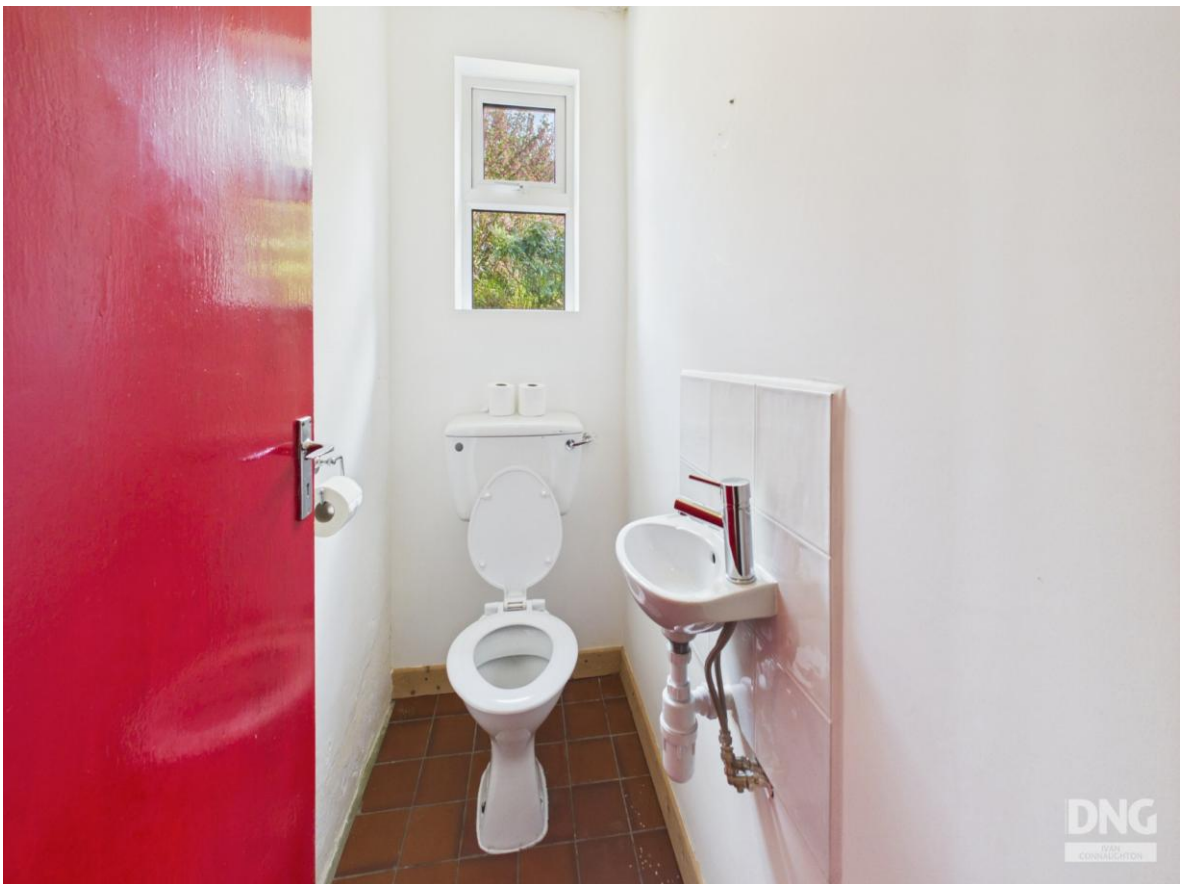
Residence On C. 37 Acres, Barroe Upper, Riverstown, F52 F207