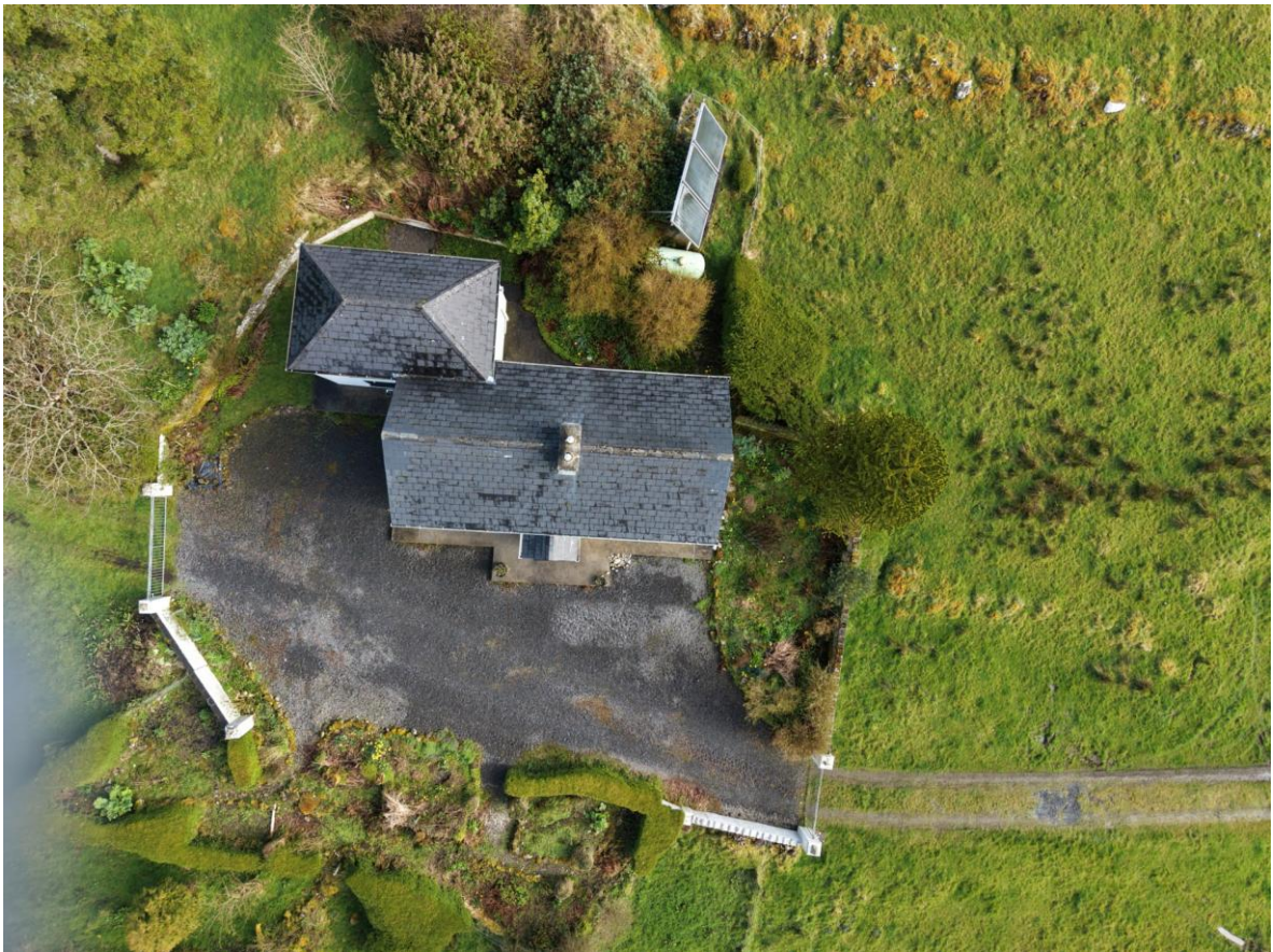
Residence On C. 37 Acres, Barroe Upper, Riverstown, F52 F207