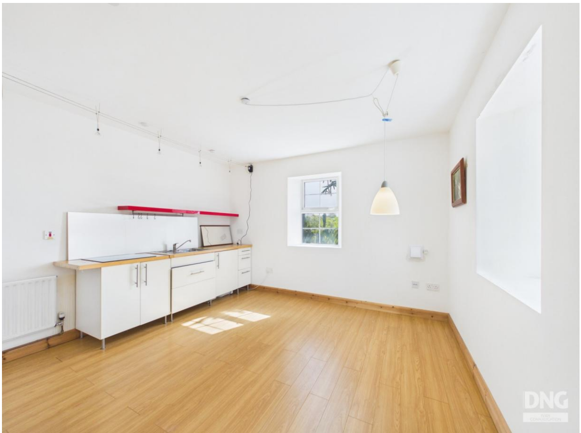
Residence On C. 37 Acres, Barroe Upper, Riverstown, F52 F207