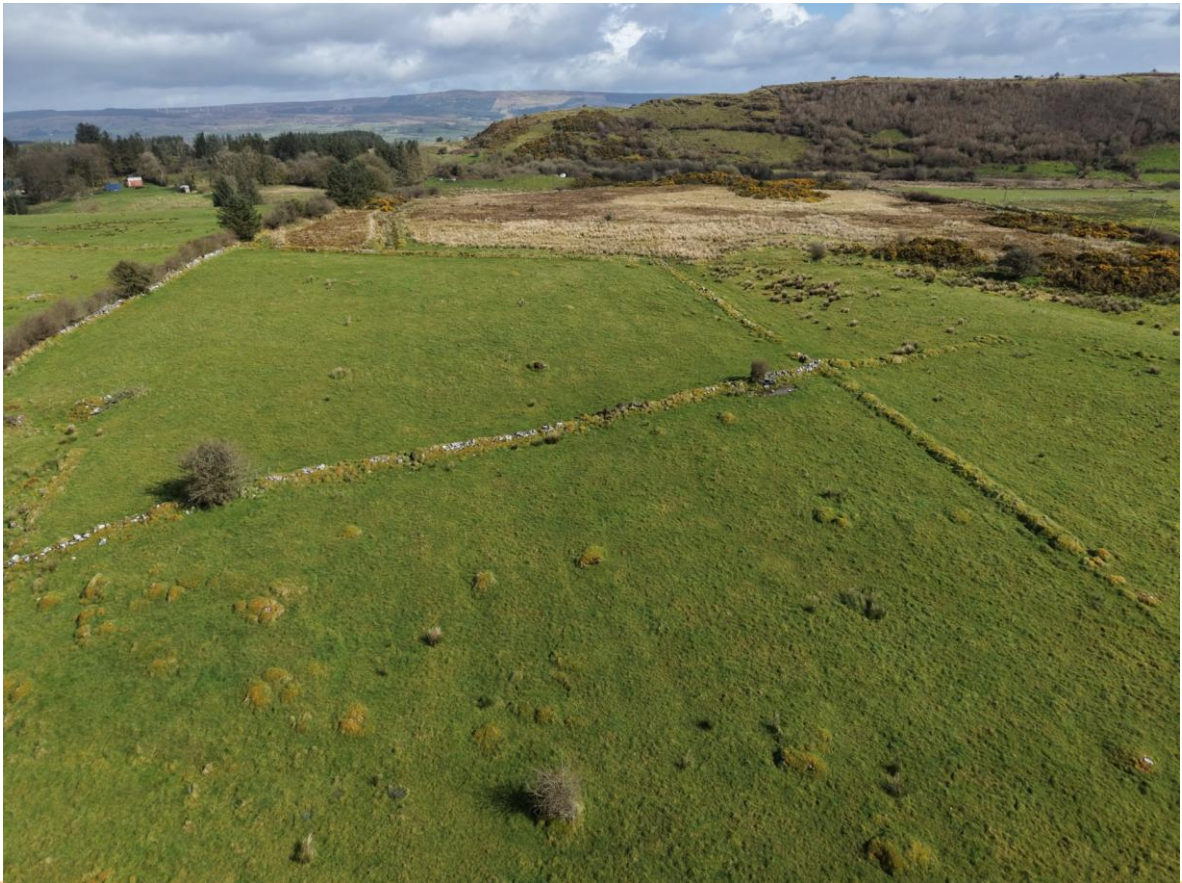
Residence On C. 37 Acres, Barroe Upper, Riverstown, F52 F207