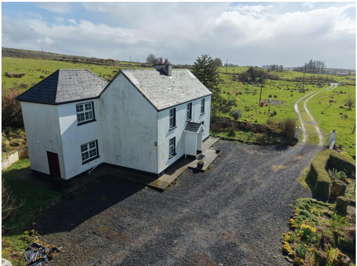
Residence On C. 37 Acres, Barroe Upper, Riverstown, F52 F207