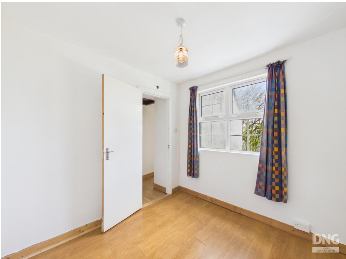
Residence On C. 37 Acres, Barroe Upper, Riverstown, F52 F207