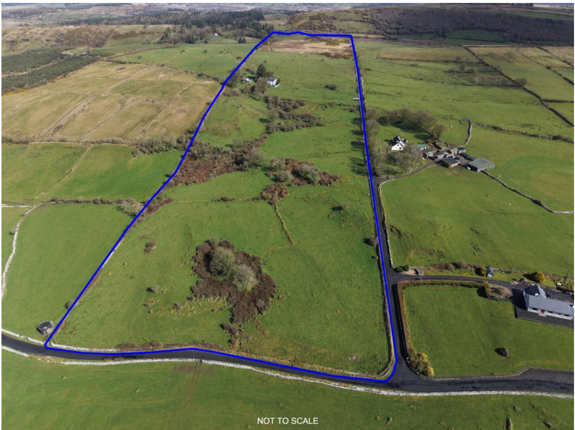
Residence On C. 37 Acres, Barroe Upper, Riverstown, F52 F207