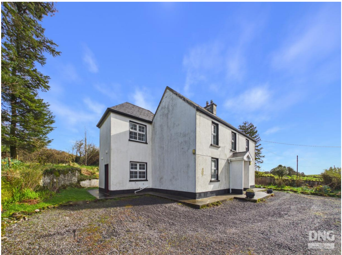
Residence On C. 37 Acres, Barroe Upper, Riverstown, F52 F207