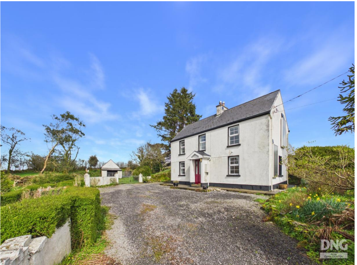
Residence On C. 37 Acres, Barroe Upper, Riverstown, F52 F207