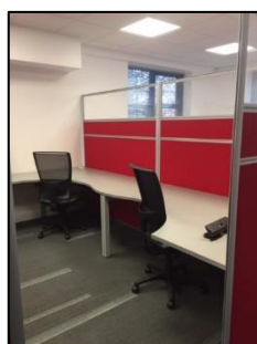
Typical Office Space