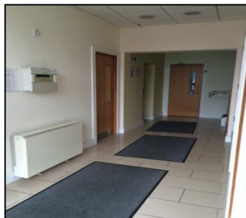
Entrance Hall (View 1)