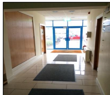
Entrance Hall (View 2)