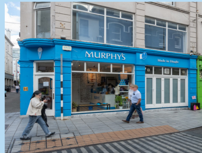
7 COOK STREET