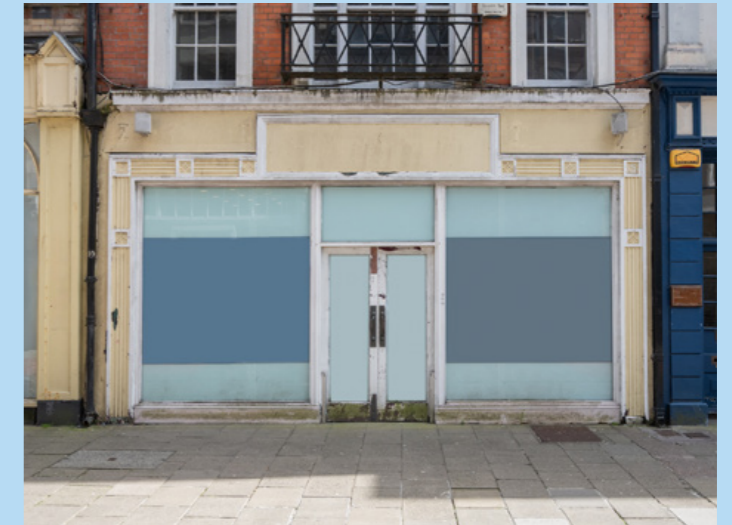
5 COOK STREET