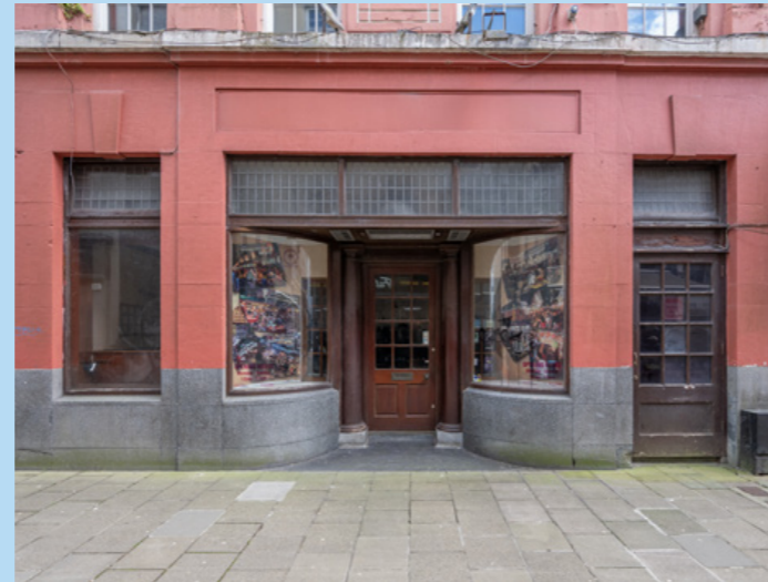
3 COOK STREET