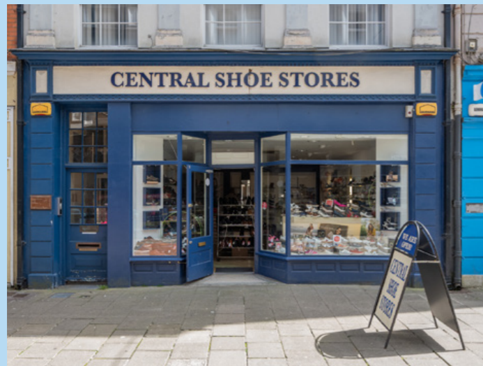
6 COOK STREET