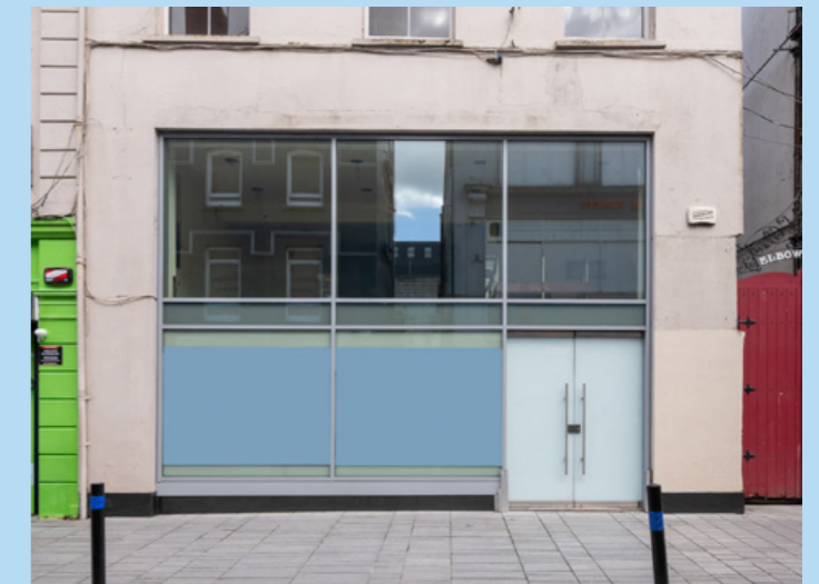
98 OLIVER PLUNKETT STREET