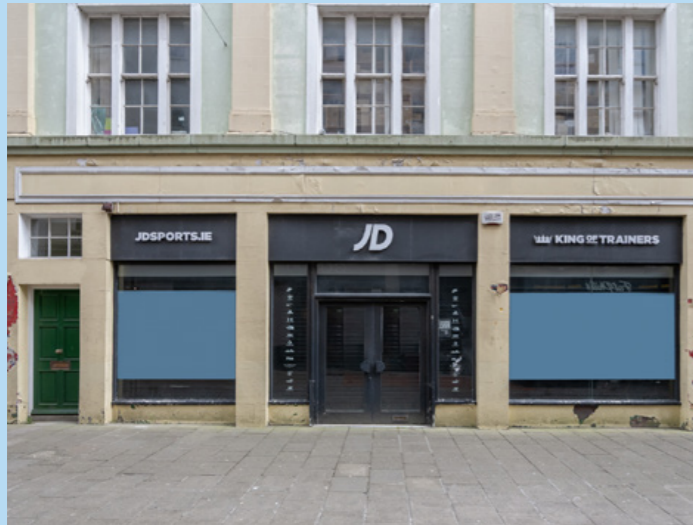
2 COOK STREET