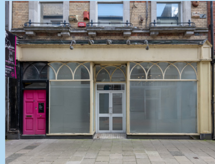
4 COOK STREET