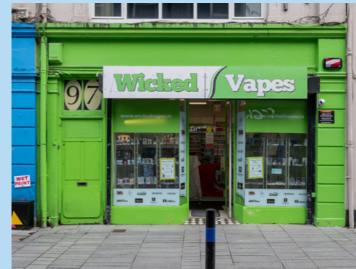
97 OLIVER PLUNKETT STREET